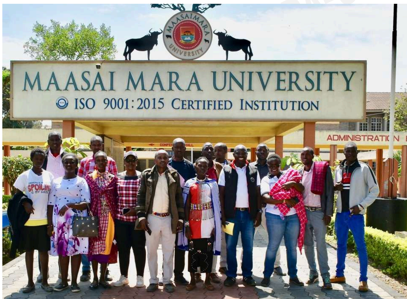
Group Photo of the visitors and the host University staff