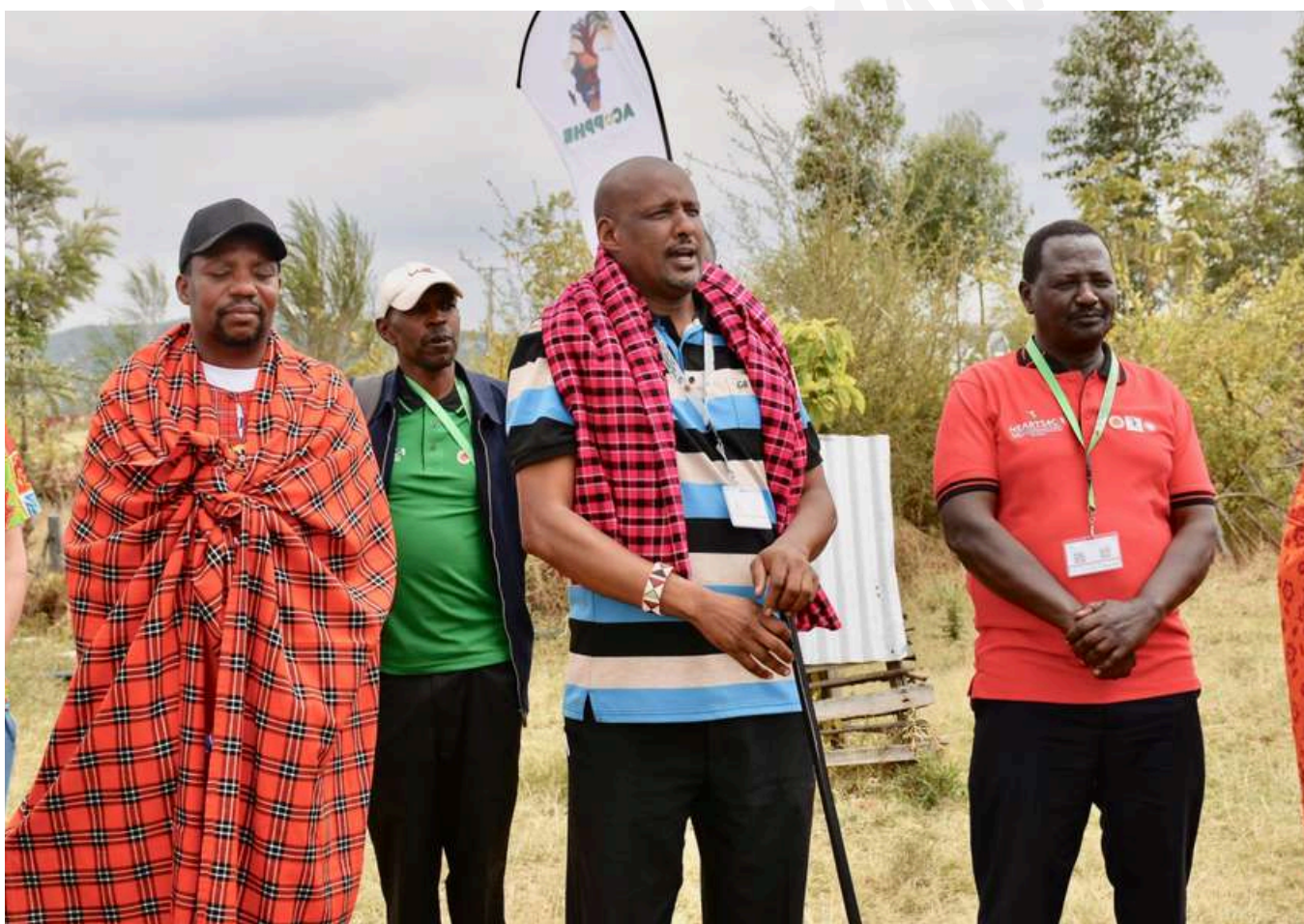
A section of participants at Mpiro Primary School for the indigenous people's declaration