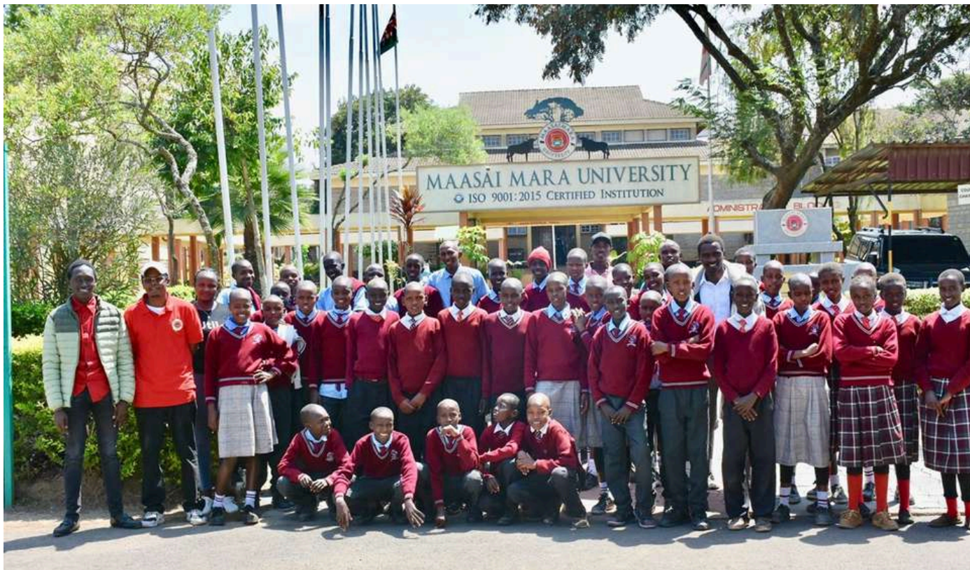
Group photo of the pupils from Kideket and Nkasioki Junior Schools with their teachers and host University staff

Pupils from Kideket Junior School, Narusura and Nkasioki, Narok West had an opportunity to tour the University for mentorship, motivation and exposure. They were exposed to various sections of the University for learning and experience