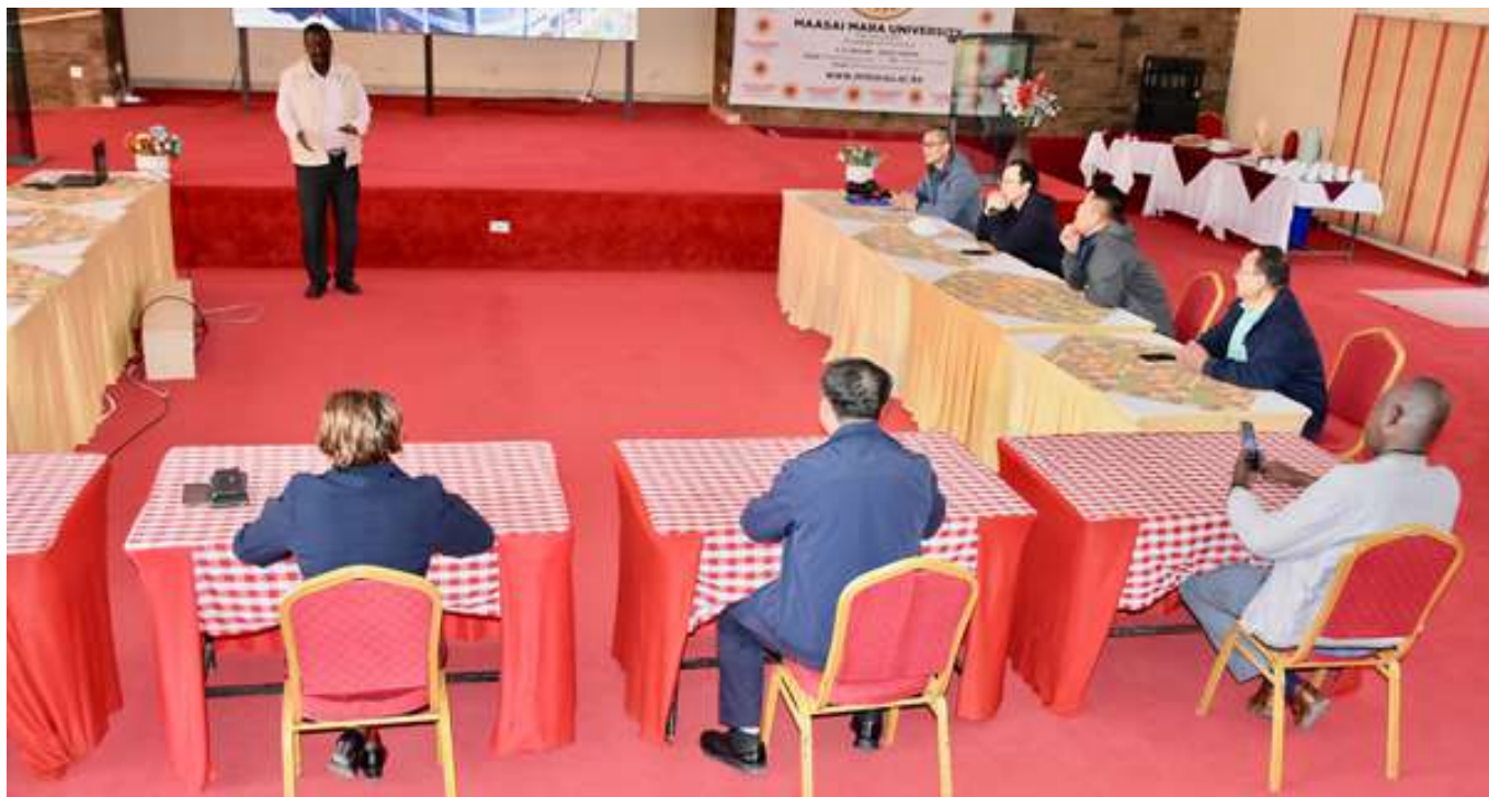
Discussion during the meeting at the conference hall