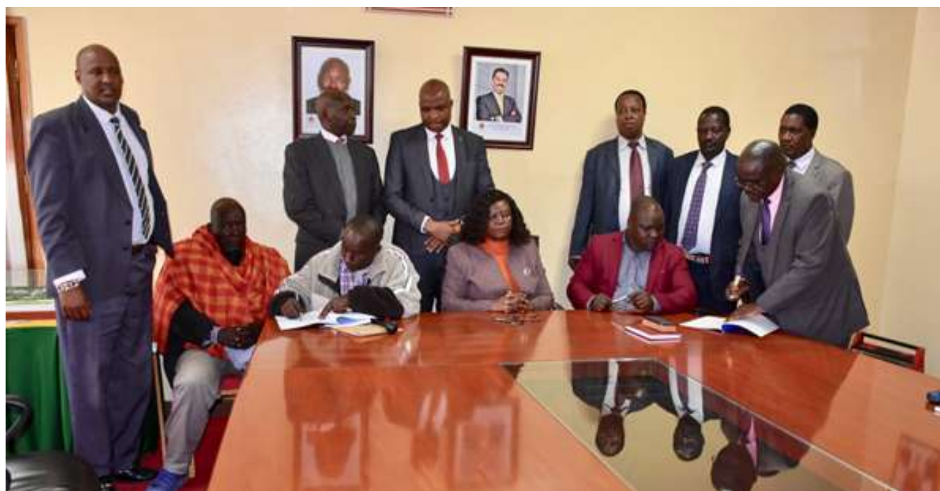
University management and representatives of the Leshuta Community with copies of the signed MoU.

The MoU outlines frameworks for continued engagement, community participation in decision-making processes, joint research, innovation and technology, capacity building and joint planning for upcoming projects on the donated land. This historic agreement marks a new chapter in the university's mission of promoting inclusive growth and building sustainable relationships with its host communities.