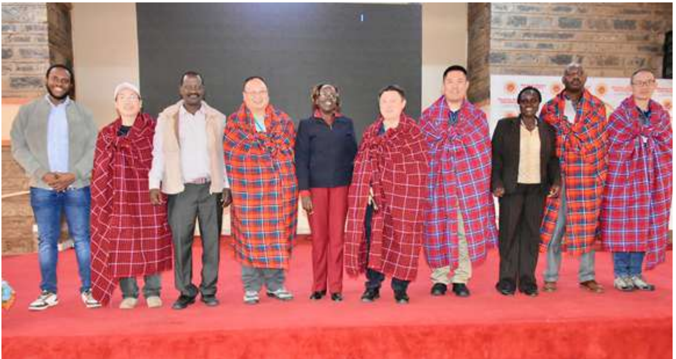
Representatives from Maasai Mara University and the Northeast Institute of Geography and Agroecology, Chinese Academy of Sciences (CAS) during the meeting