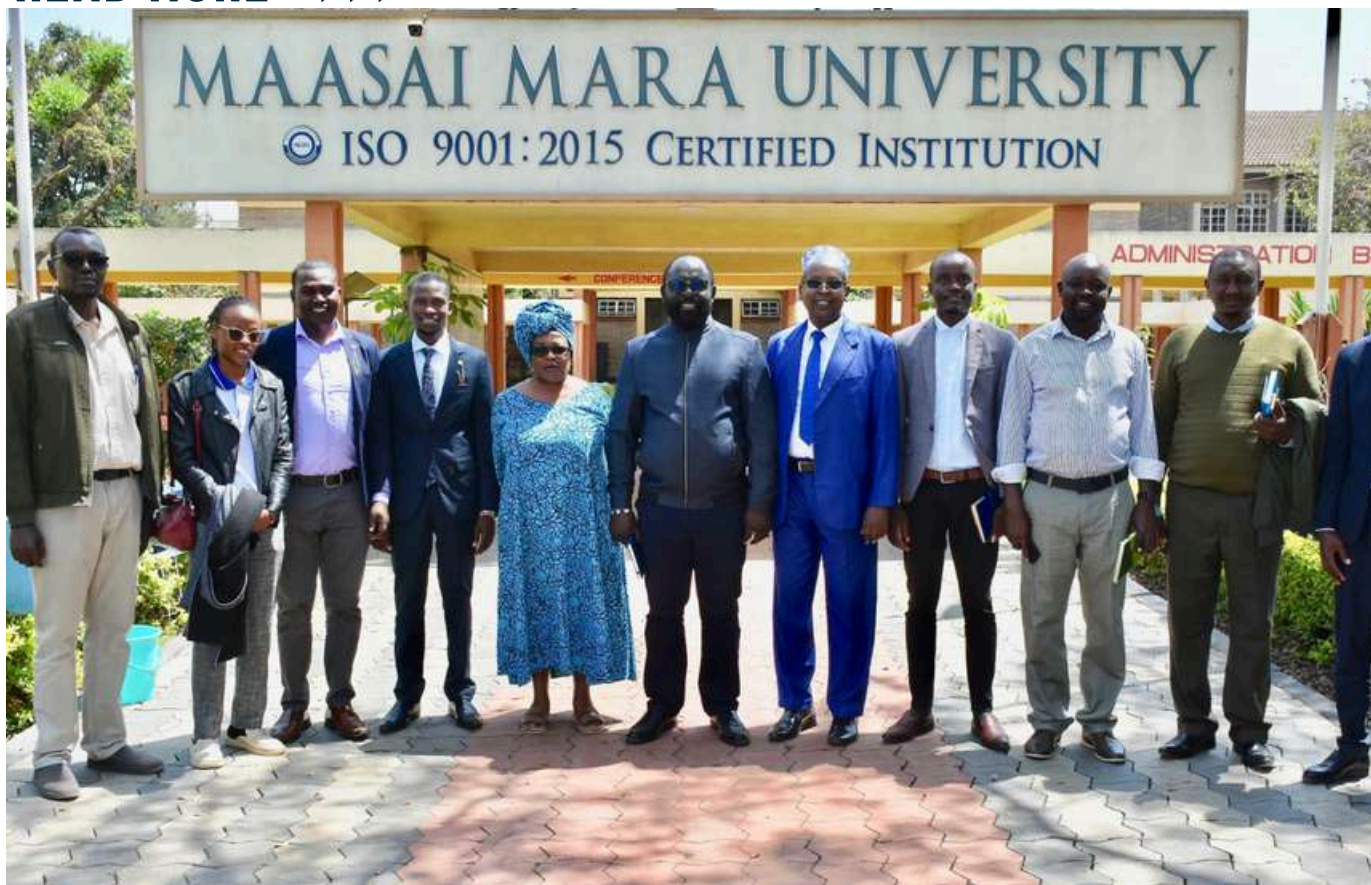
A group photo of Kaimosi Friends University team with Maasai Mara Representatives