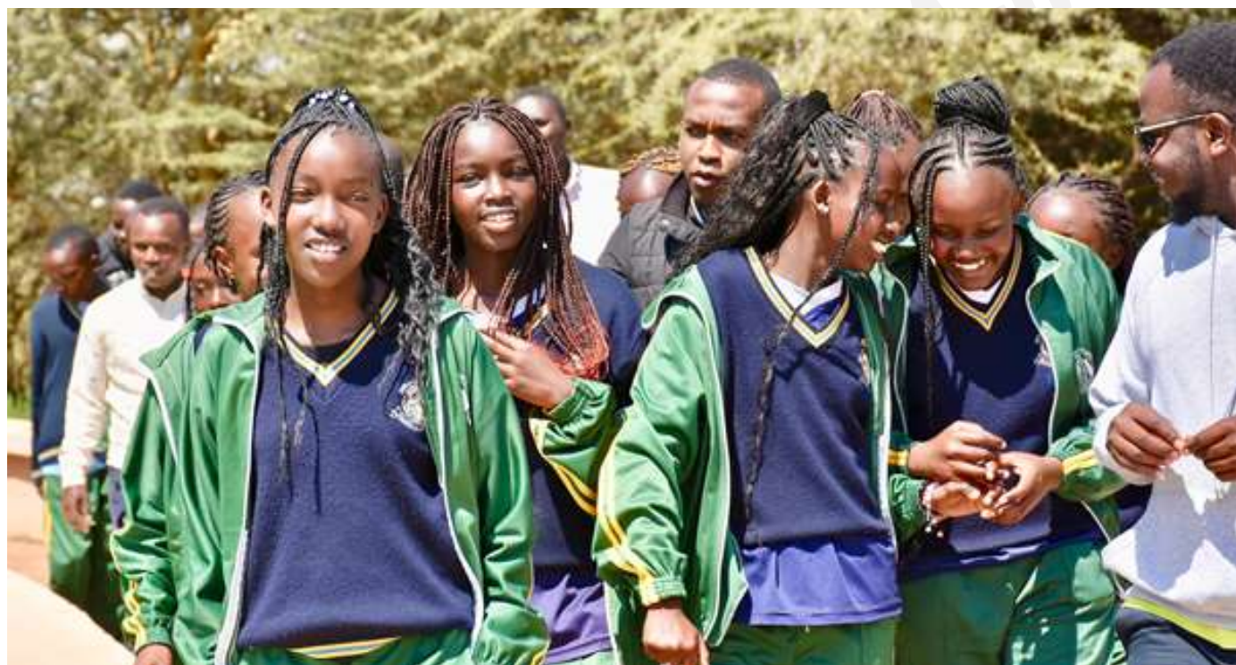
Ancilia Catholic Academy, Eldoret pupils enjoying the Botanical Garden