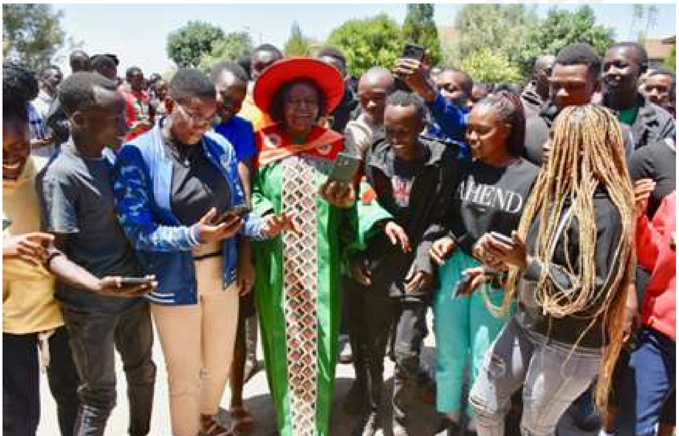
New students scrambling for a memorable moment with the Vice-Chancellor