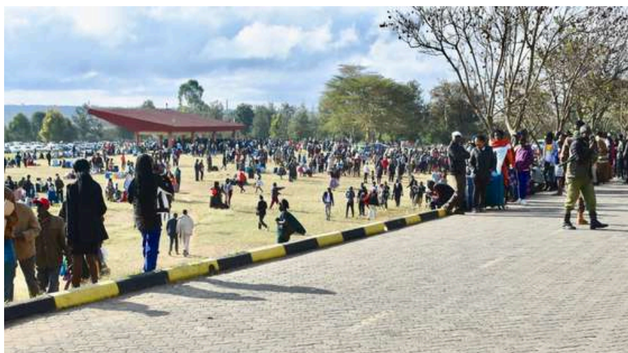
A crowded scene during the reporting day for 2025 new students.