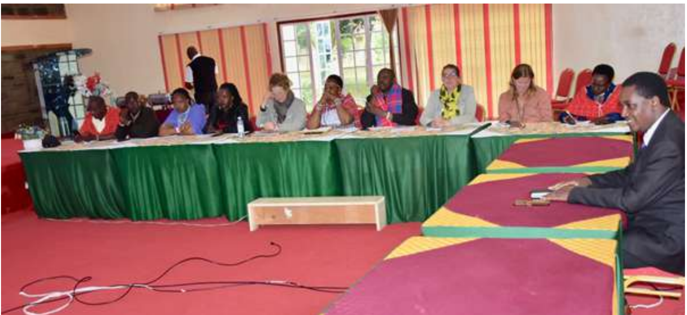
Representatives of the institutions in a meeting session.