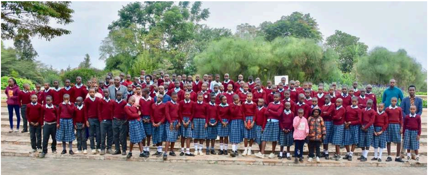
Pupils from Chamaner Comprehensive School, Bomet in a group photo at the Botanical Garden.

The pupils were privileged to have a feel of the University Lecture theatres, Library and the ICT Centre for lifelong learning and experiencing the technological tools and skills. The visit served as a powerful motivator for the pupils inspiring them to pursue their academic goal with dedication and determination.