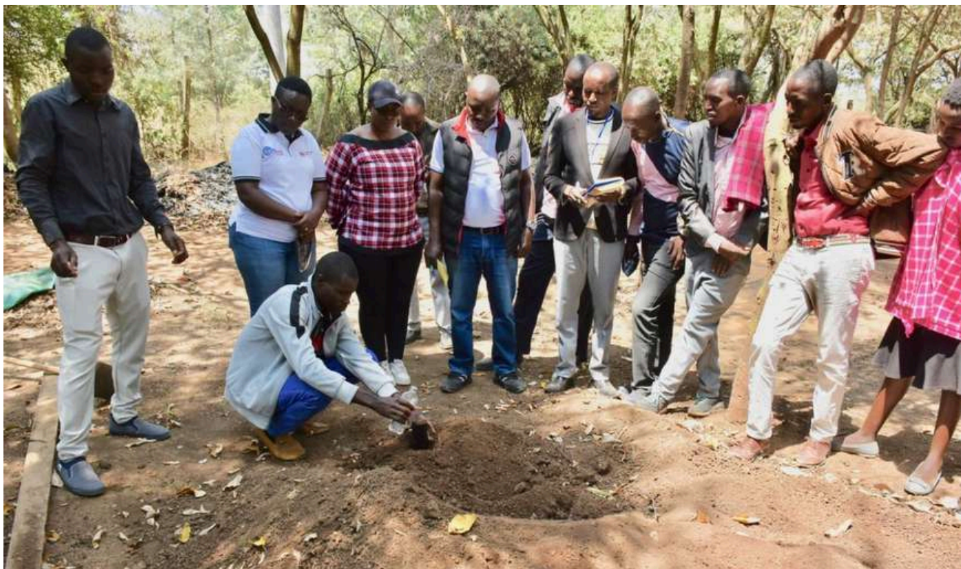
Practical sessions during the bench marking visit