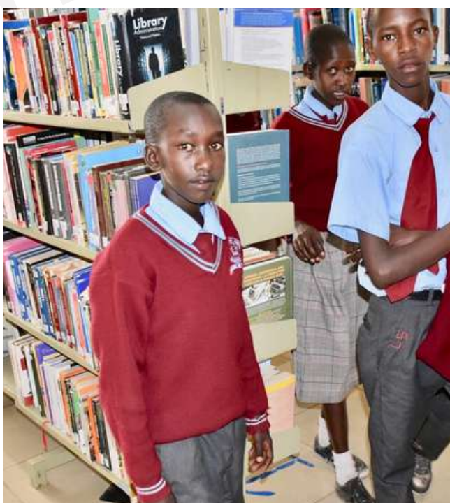
A section of the pupils in the Library