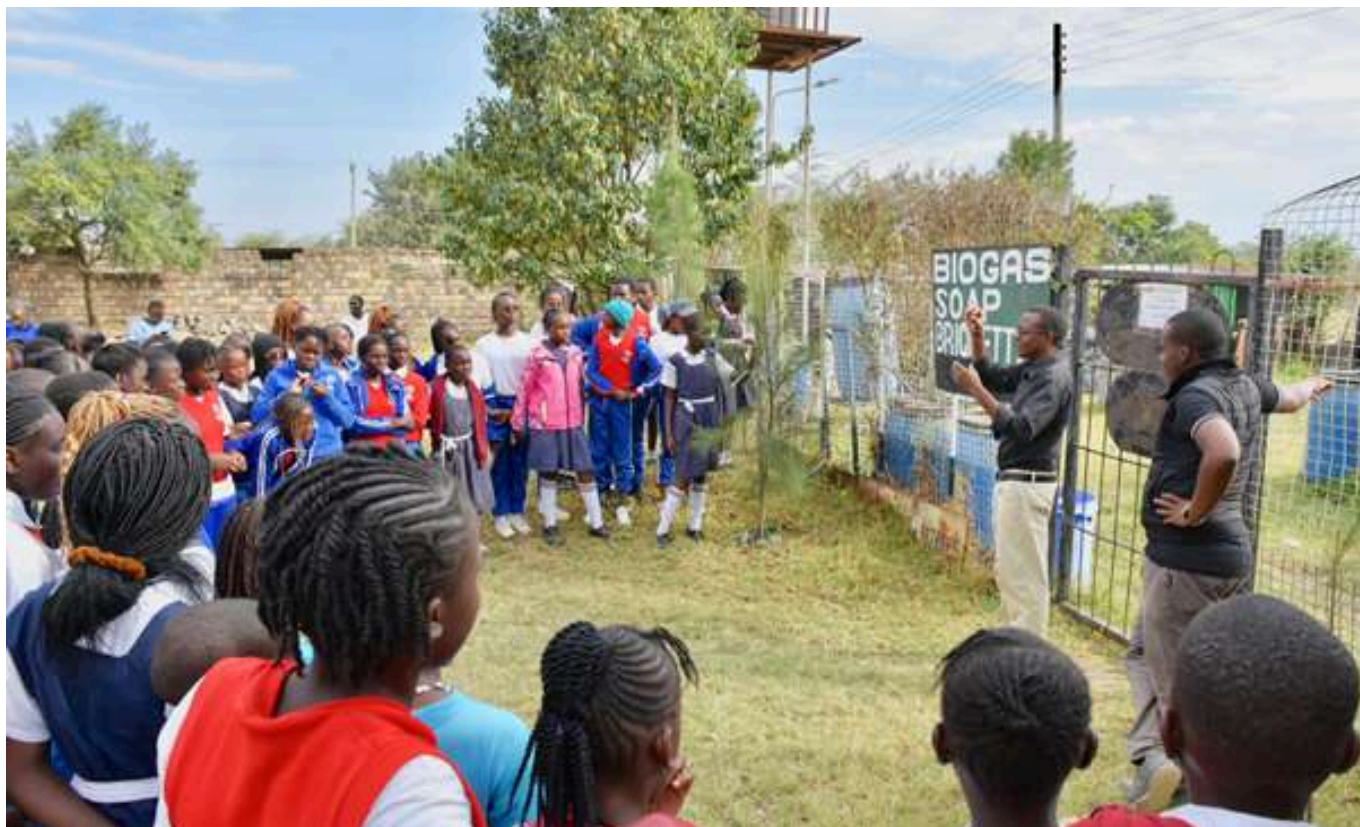
The Visiting St. Mary Comprehensive School , Kibuye, Kisumu being highlighted about the renewable energy centre.