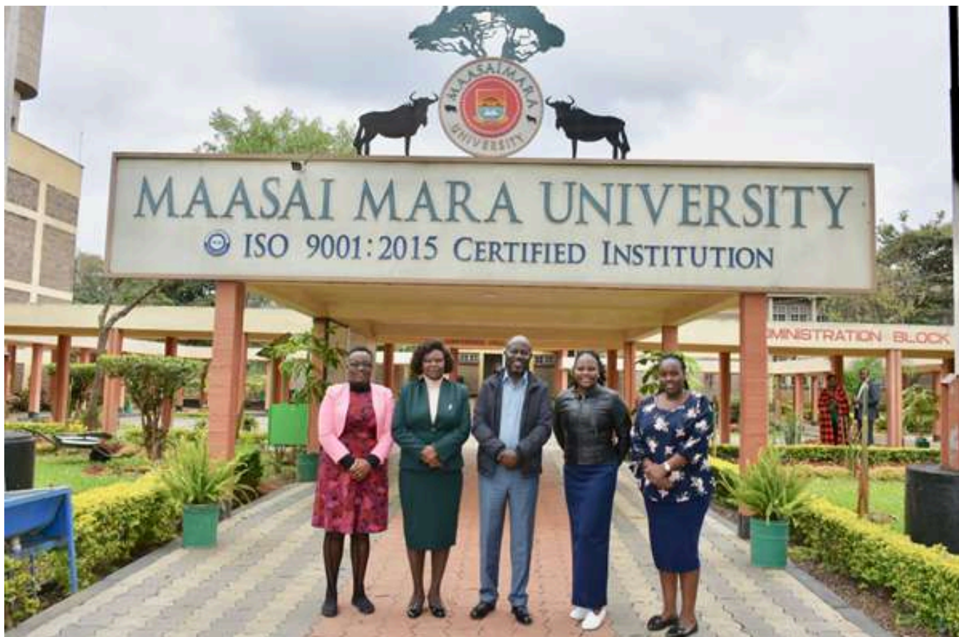
A group photo with the Vice-Chancellor ( 2 nd from left) after the meeting