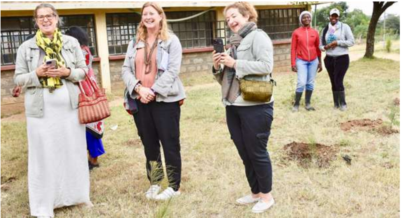
A cross section of the visitors in tree planting session

This collaboration signals a forward-looking partnership rooted in mutual respect and a shared goal of safeguarding indigenous knowledge. It aims to strengthen cultural identity while creating academic opportunities that are relevant, respectful, and community-driven.