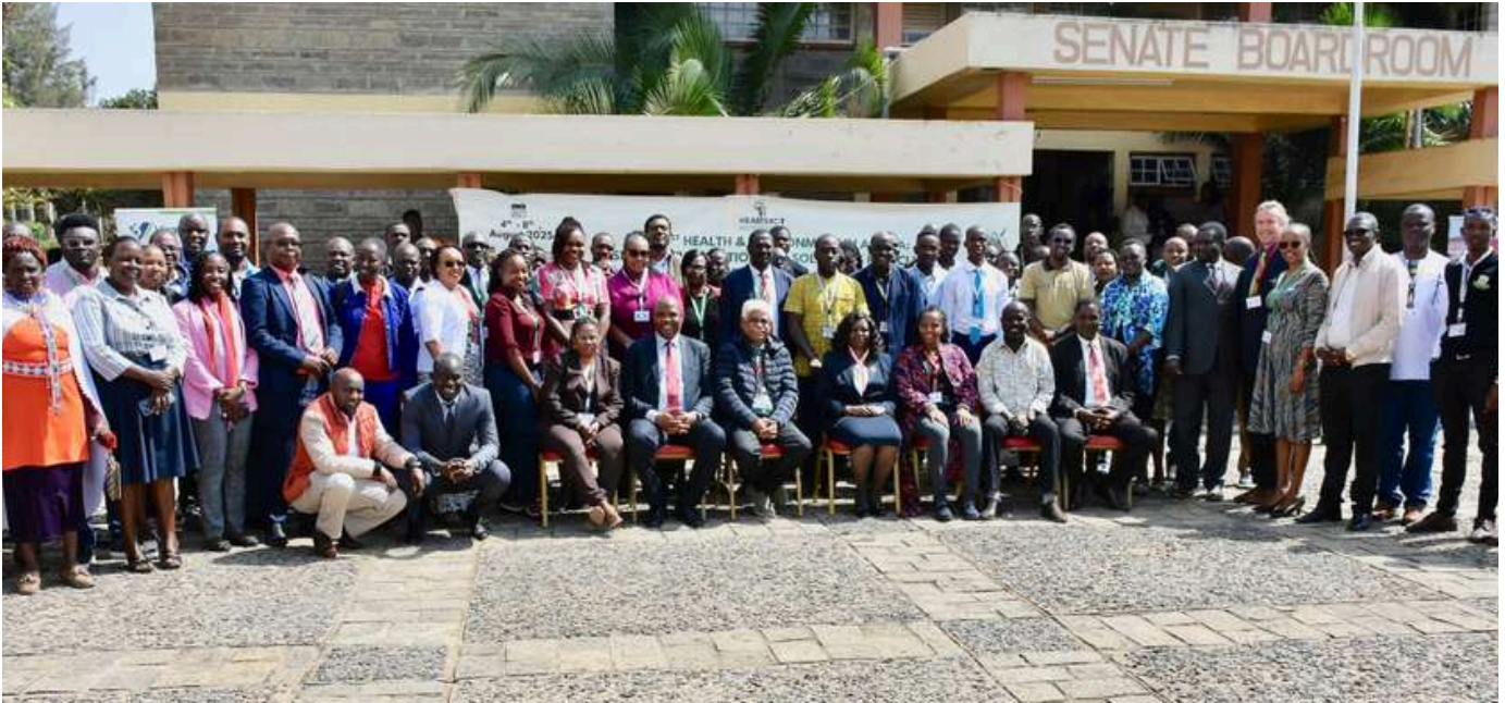
A cross section of the conference participants in a group photo

Impactful Street Clean-Up Walk, brought together passionate partners, students, and community members for a cleaner, greener environment. Participants walked for 7 km , rode bicycles and cleaned up Narok town from Motonyi Hill to Maasai Mara University.