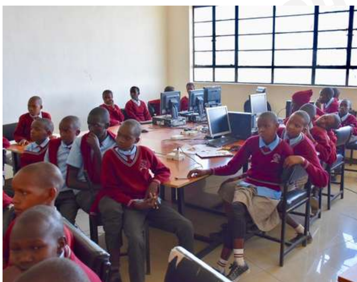
The pupils in the ICT section