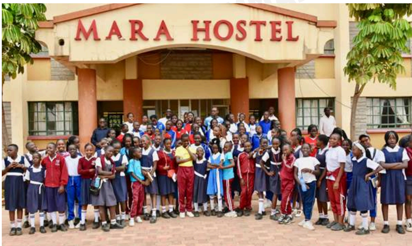
St. Mary Comprehensive School Kibuye, Kisumu pupils in front of Mara Hostel

The team was privileged to visit the University hostels, Student Centre and other facilities where they got a glimpse of "campus life". This experience played a major role in shaping their career path. The students exhibited great dedication and determination towards academic excellence. Maasai Mara University prides in guiding students to learn more about higher learning and how to use their skills, career and talents to serve a broader community. As they exited the University premises the confidence of knowledge transferred to our young ones keeps shining beyond the Maasai Mara University gates.