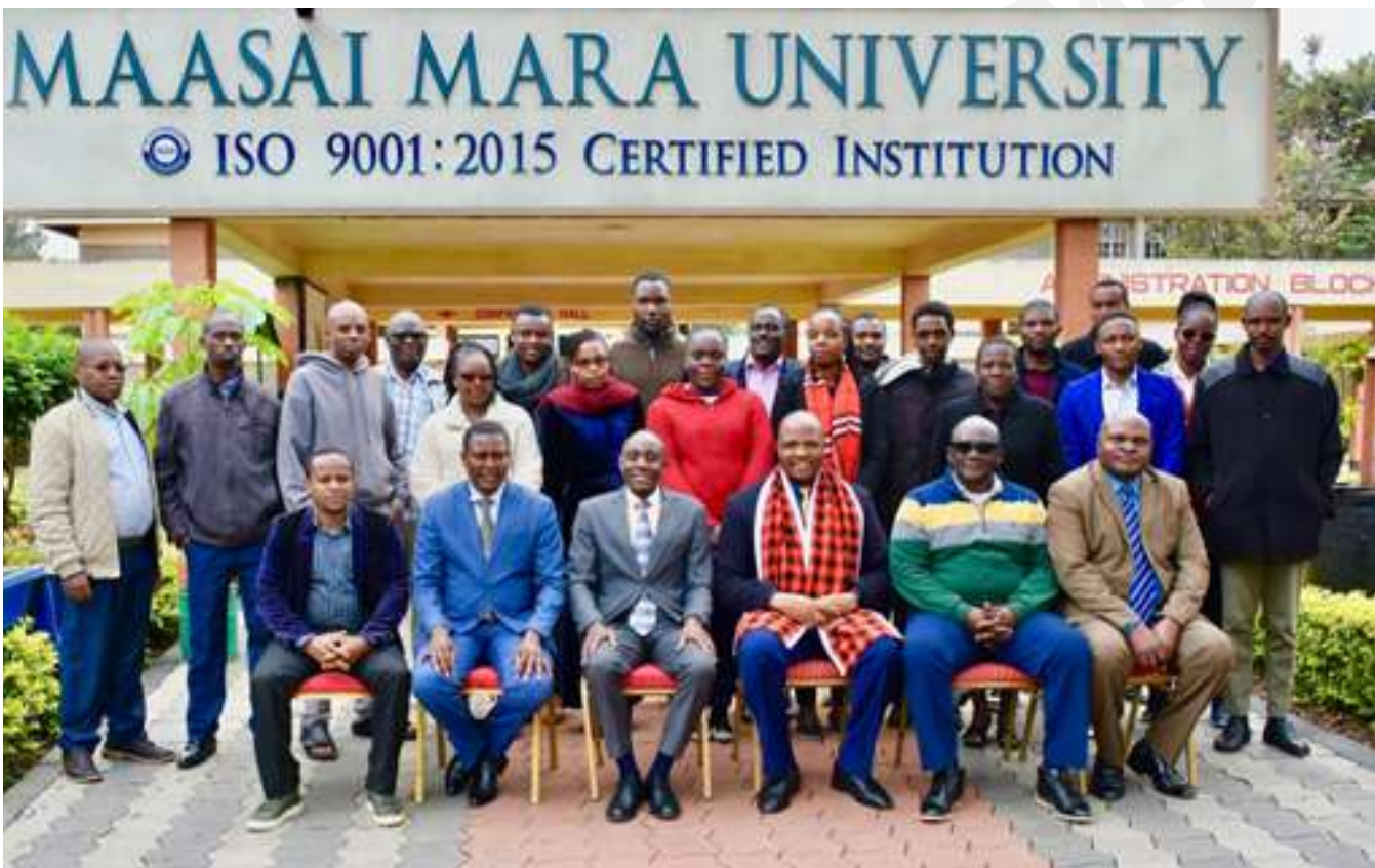
The Workshop participants group photo.