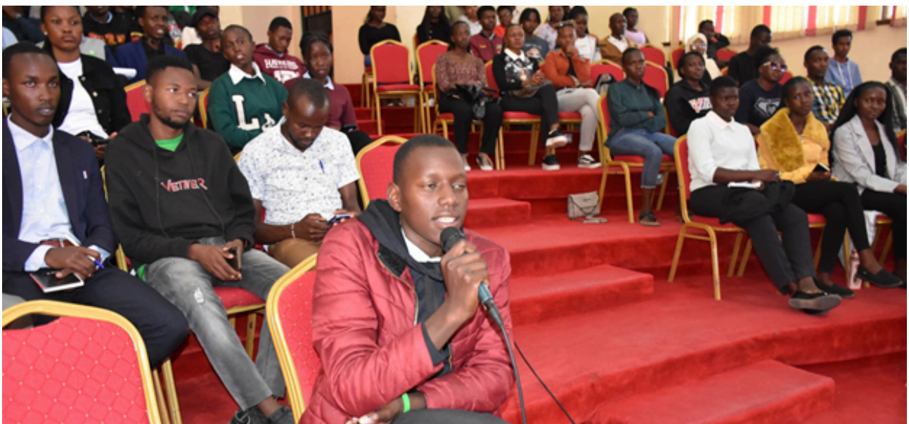
A journalism and media student contributing during the sessions

It was a highly valuable experience that was an eye opener on investigative journalism as a key element in professional journalism. The department plans to have more such events to ensure that communication and media students align their skills with industry expectation and also in line with the oncoming Competency Based Learning.