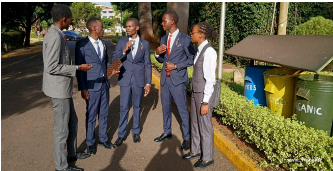
Student leaders consulting during the induction

Based on the above, Maasai Mara University students, peacefully and maturely conducted their campaigns and successfully elected their leaders from 15 th January to 13 th February 2025. The elected leaders are listed below.