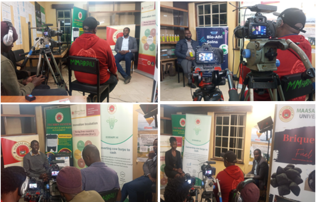
Some of the interviewees during the interview sessions

The mode of evaluation was through in-person video interviews. The interviews were conducted by the British Council and moderated by KeNIA.