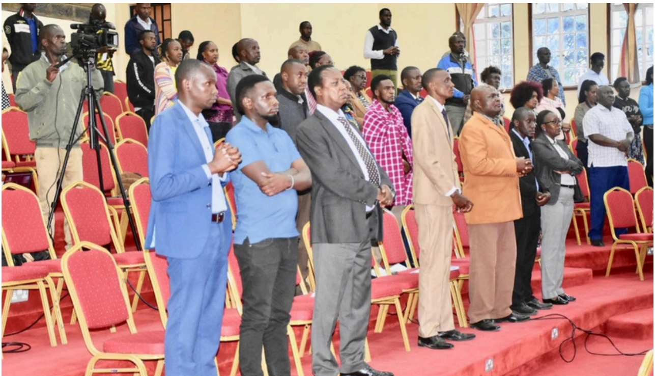
A cross-section of members of staff and visitors during the prayer session