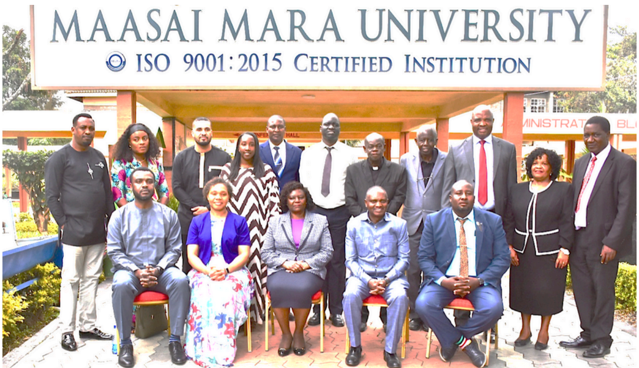
A group photo of the University management and the visitors