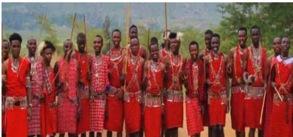
Maa Students Cultural Troupe Performing the Winning Maasai Cultural Folk Song