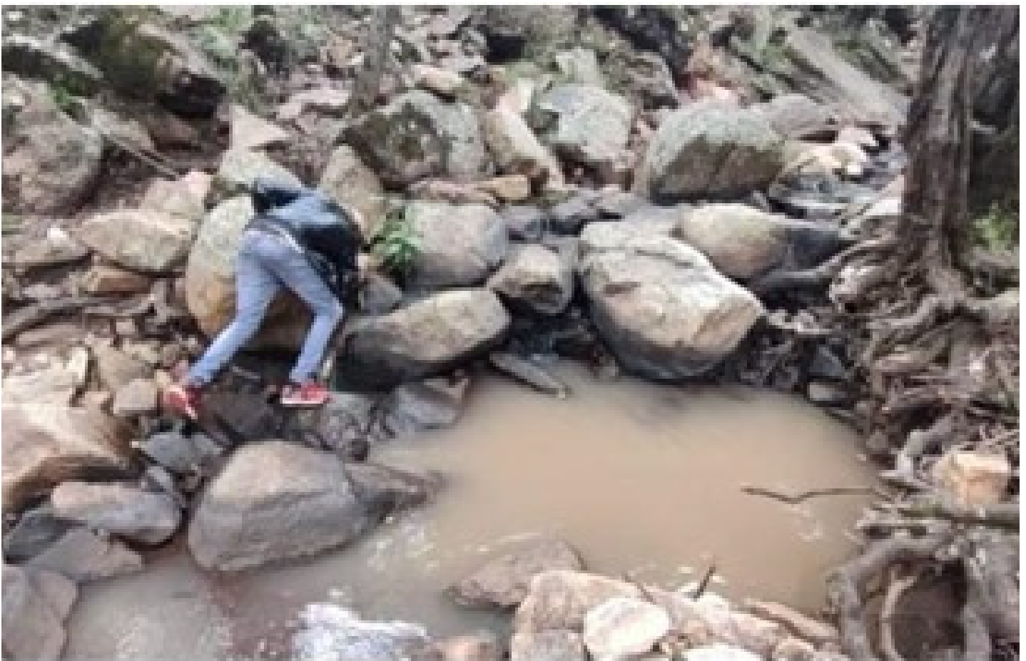
Turbid spring water source that could be tapped for local use in Leshuta

This contribution represents the beginning of what promises to be a fruitful partnership between Maasai Mara University and the local community. As the Chancellor emphasized during his visit: "Now is the time to make momentum. The partnership becomes even better as we work together in collaboration to make a real difference for the community."