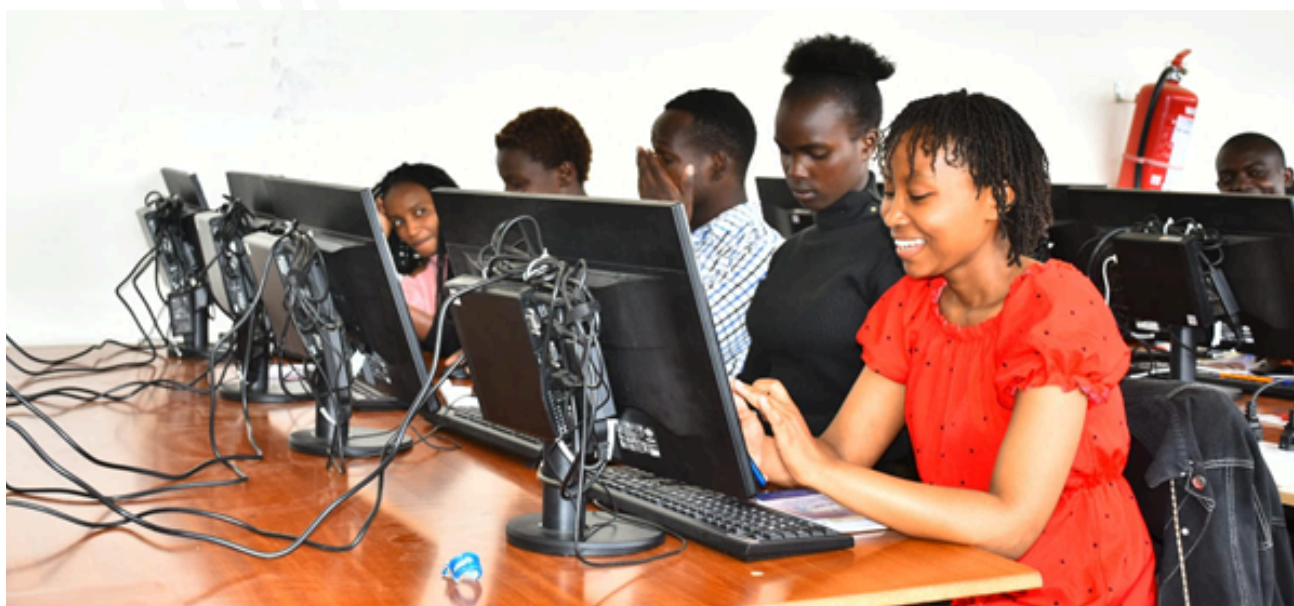
Students following the programme proceedings

Through the Centre for Student Career and Placement Services, this programme will be added advantage to our students since they're able to have practical feel of areas like accounting, sales and human resources in the business world through the games.