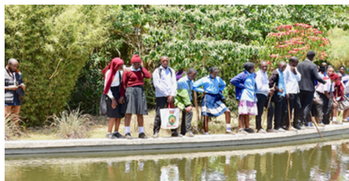
Some of the students admiring the beauty of the Botanical garden