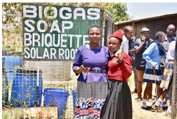
A teacher and a student at the renewable energy centre