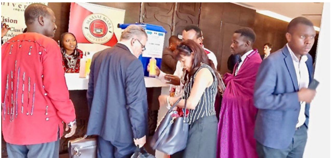
Visitors seeking information at the University booth