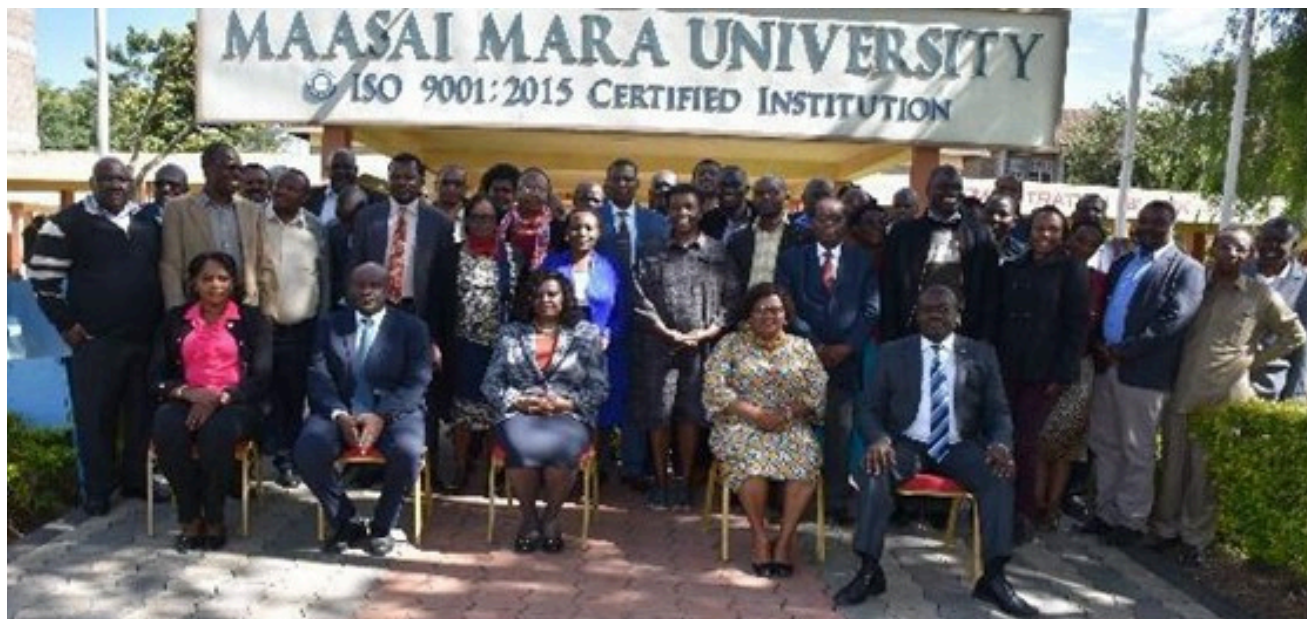
A Group photo of the Vice-Chancellor ( Seated middle), team of facilitators from KICD and the academic staff.