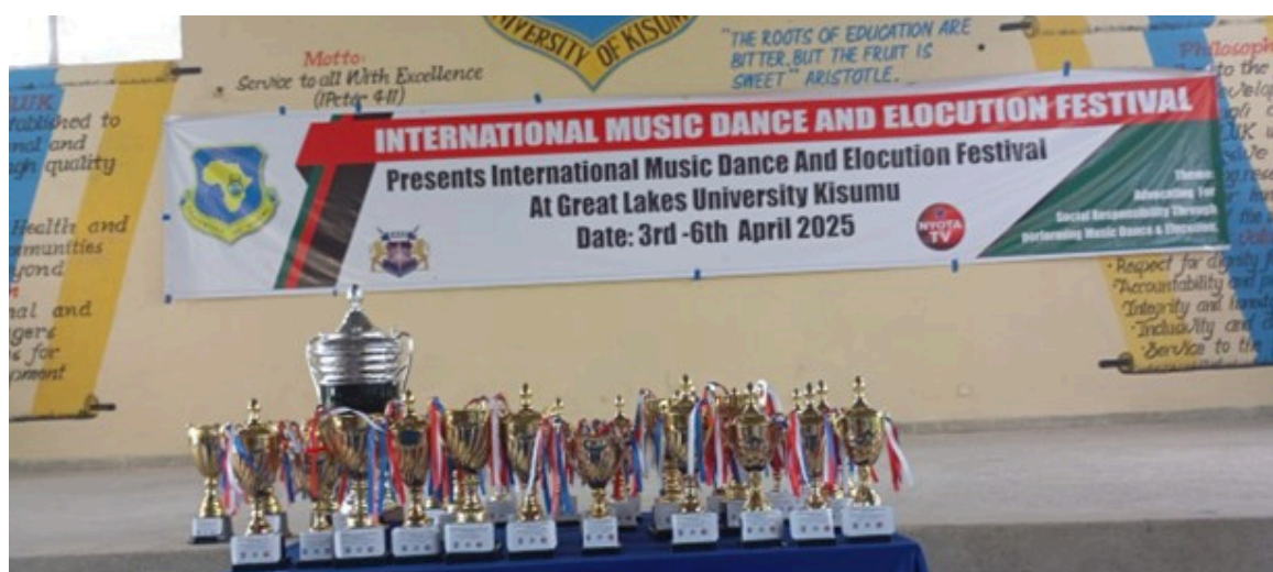
Maasai Mara University Harvest of Twenty Trophies During the International Extravaganza at The Great Lakes University of Kisumu