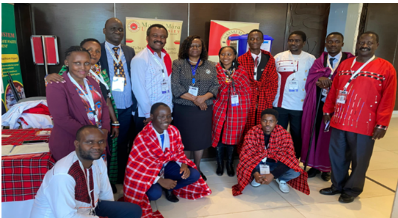
Maasai Mara University team and the Vice-Chancellor (Middle) during the World Chambers Federation

The 1st WCF Africa Summit 2025, organized by the World Chambers Federation (WCF) in partnership with the ICC and KNCCI, was held from 9th to 11th April 2025 at Radisson Blu Upper Hill, Nairobi, Kenya. Under the theme “Africa’s Global Future: Integrated, Innovative, and Sustainable,” this historic event brought together business leaders, investors, enterprises, and government stakeholders across the globe. Maasai Mara University was the only institution of higher learning that participated in the event, courtesy the Kenya National Chamber of Commerce and Industry (KNCCI). The summit featured B2B match-making, investment forums, policy dialogues, and African Continental Free Trade Area (AfCFTA) masterclasses, all aimed at fostering economic growth and trade integration. The summit focused on boosting trade and investment, promoting sustainable practices, empowering youth and women, supporting MSMEs, and strengthening regional integration under AfCFTA. The summit was seen as an opportunity to showcase Africa's global trade prowess and to attract investment.