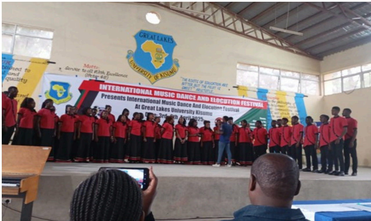
Performing University Anthem

Maasai Mara University students took part in the international Music Extravaganza organized by the Great Lakes University of Kisumu in collaboration with Nyota TV from 3 rd – 6 th April, 2025.