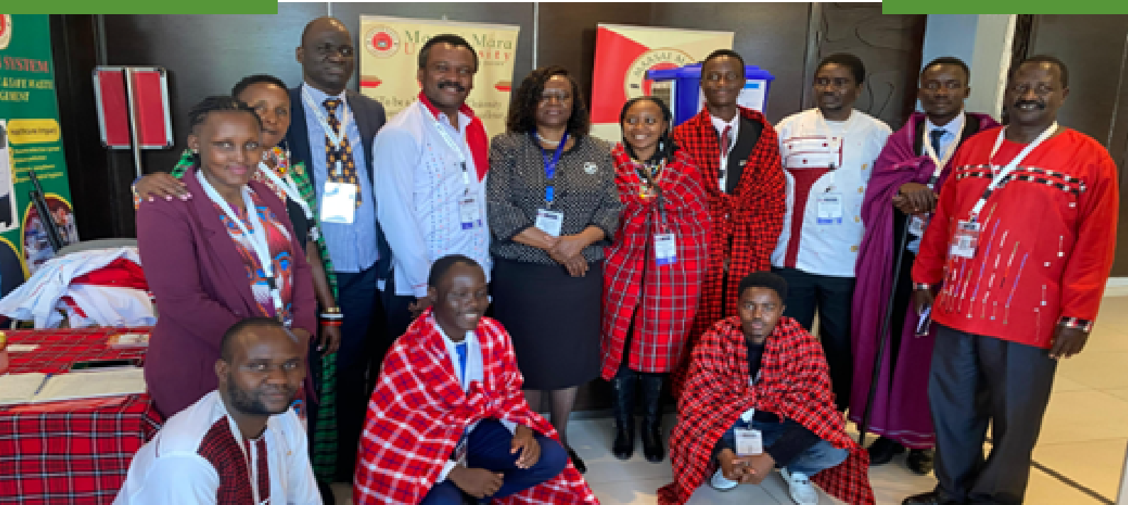
Maasai Mara University team and the Vice-Chancellor (Middle) during the World Chambers Federation Africa Summit