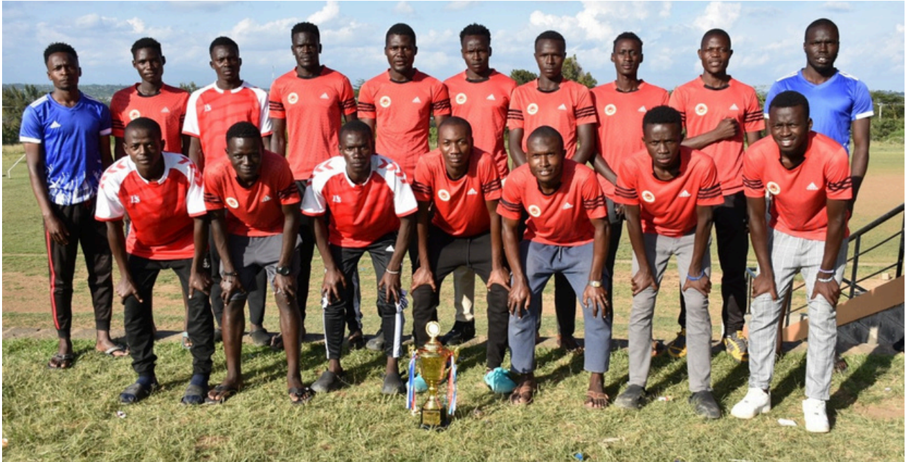
The roaring Masimbas with the trophy after the win

Maasi Mara University soccer team popularly known as Masimbas qualified for East African Games after emerging victors at the Kenya University Sports Federation (KUSF) Nationals held at Kenyatta University. In a weekend of gruelling duel and passion, the Masimbas' resiliency and unmatched sportsmanship conquered Kenya. The team sailed to the finals after their opponents in both the quarter and semi-finals were disqualified due to ineligibility issues.