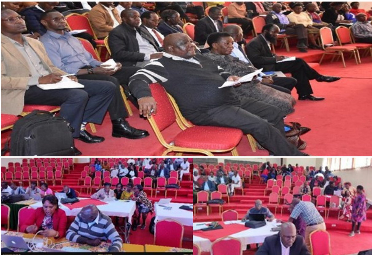
Academic staff during the training workshop and during the hands on group activity on curricula development