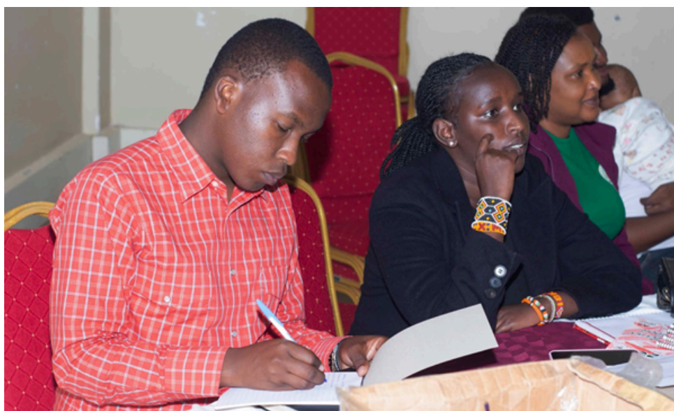
Some of the partners for the initiative following proceedings