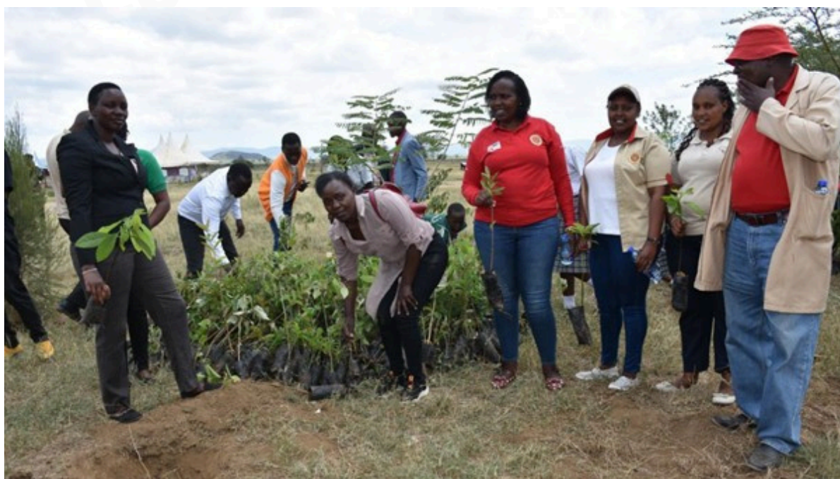
A section of the University staff who participated in the International Day of Forests (IDF), 2025