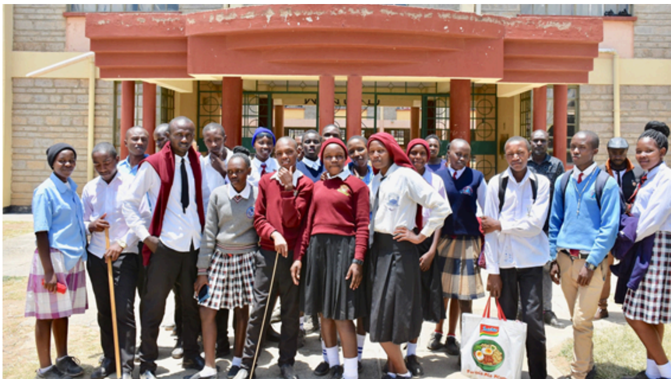
Students from Narok North in a group photo during their University tour.

The University hosted representatives from eight secondary schools from Narok North for an extensive tour of the University environment and facilities. The students from Ntimama, Olposumoru, Olorropil, Enabelibeli, Kisiriri, Oloserian, Olmariko and Entiyiani Secondary Schools toured the Botanical Garden, Centre for Innovation, Hostels, Lecture rooms, the Library, ICT and other facilities. The visitors had opportunity to be mentored, advised, guided, and mingled with University students.