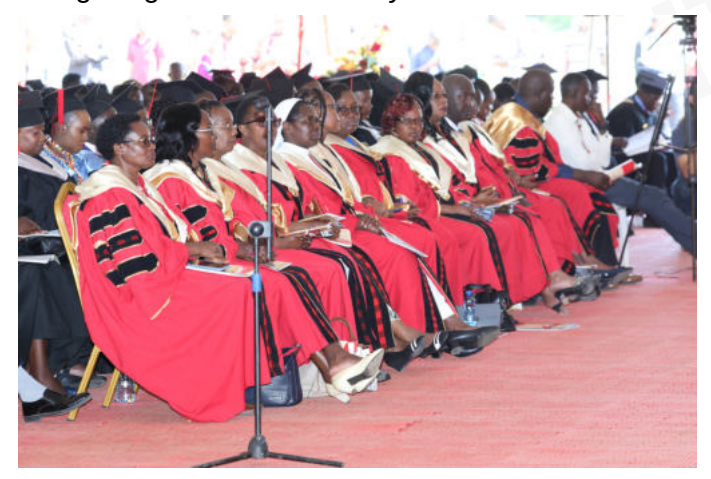
PhD Graduands during the graduation ceremony.