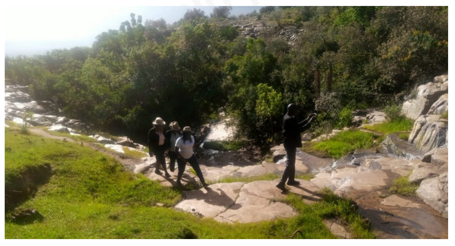
Some council members take a walk through the breaths taking river bank at Leshuta land