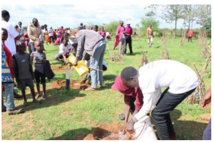
Participants planting trees at the Enoosupukia Forest

over-emphasized. To counteract deforestation, safeguard watersheds, and enhance soil quality, the nation plans to plant 15 billion trees, of which Narok County will plant 100,000.