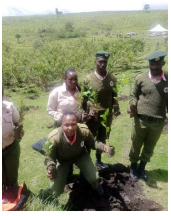
Participants planting trees at the Enoosupukia Forest

Under the direction of the Acting Vice-Chancellor, who is passionate about