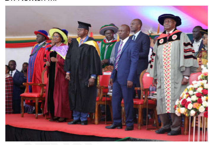
Chief guest with other VIPs