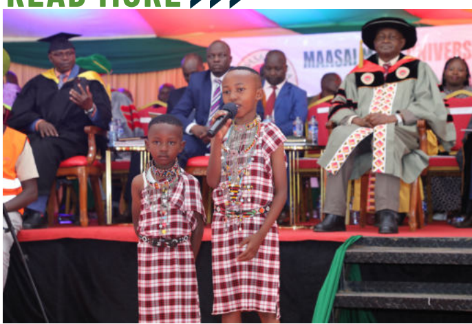
Children entertaining crowd.